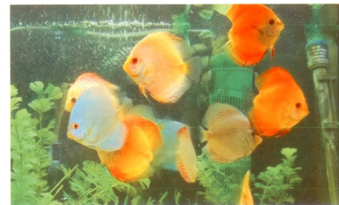
It's as simple as that!

Once a week change 10-20 % of the water or once every 2 weeks change 30 % of the water; at the same time remove algae, clean the sides (just use a scraper) and suction the bottom with a special hose to remove dirt.