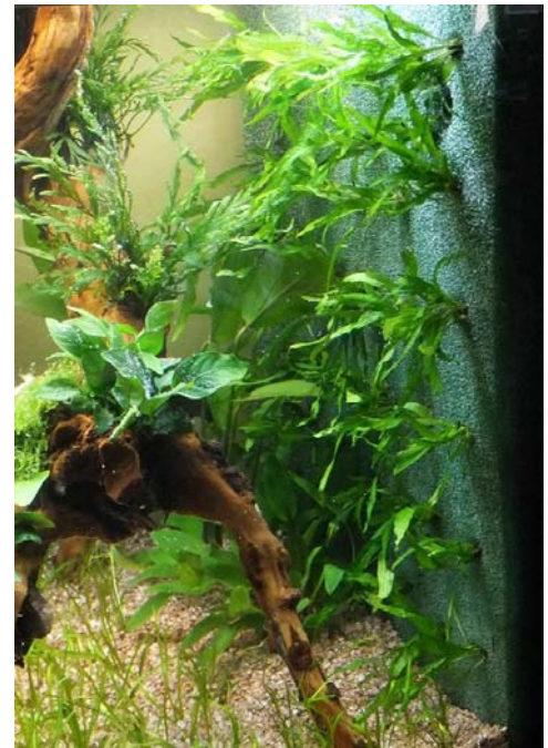
Filter mat freshly planted with Java fern (Microsorium Pteropus). (Simply cut slits into the mat and place the plants into the slits.)

The equipment is hidden behind the filter mat, including: 7 Watt pump, thermometer, heating rod.